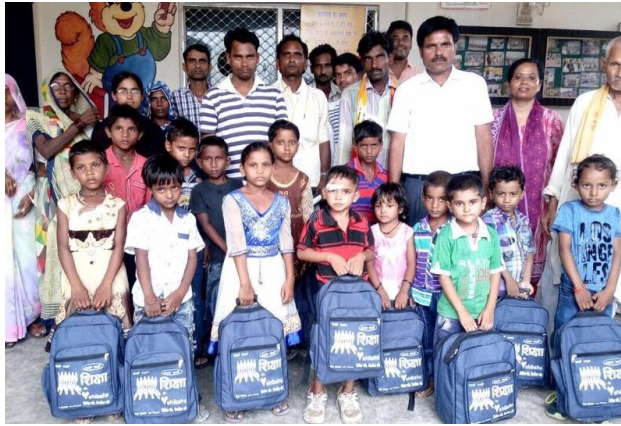
Child Education support