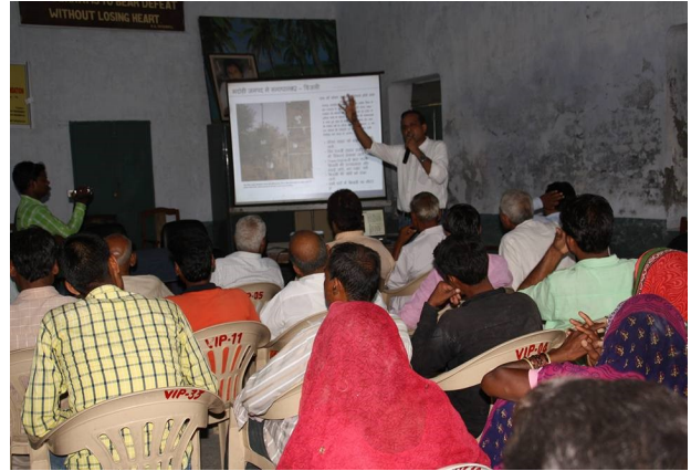
Presentation in Workshop