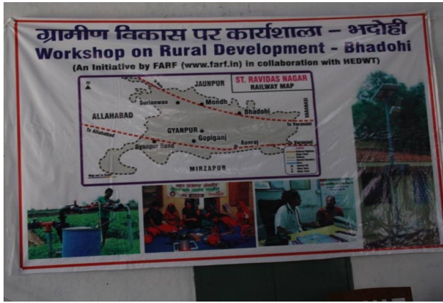
Rural Development Workshop (September 2016)