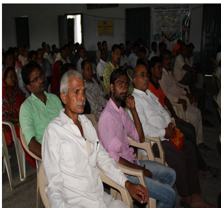
Public Participation in Workshop