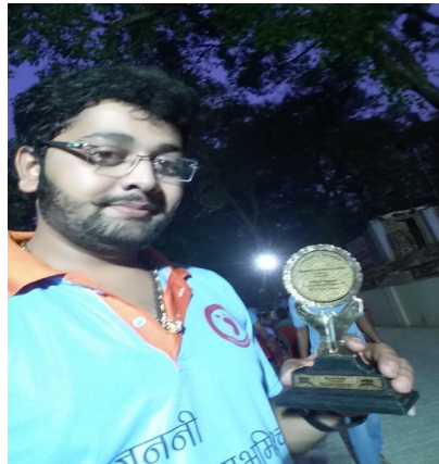
Bhadohi Social Service Award by FARF